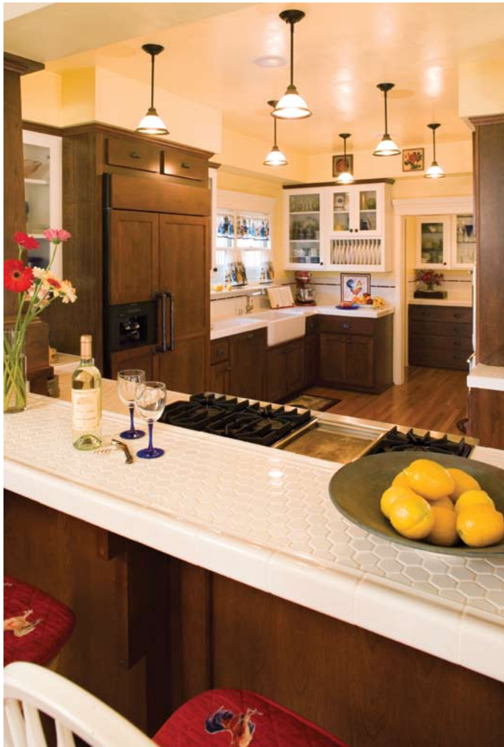
Forgoing granite and other stones commonly used in kitchens today, the Stouffers chose to remain true to period style with subway tile for the backsplash and hexagon ceramic tile for countertops. A raised eating bar and modern appliances bring the space up to date.

a hands-on approach. For more than two years, the couple lived in a small upstairs bedroom while methodically and meticulously reconstructing their home. Before beginning demolition and reconstruction, they toured historic homes and pored over “practically every magazine and book published on Craftsmans,” says Linda, a bank executive and watercolorist who selected the 20 different paint shades used throughout the home.